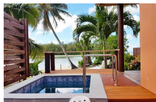
1 Bedroom Studio mini spa pool

Bottle of water, milk, cereals & fruit juice on arrival, free use of kayaks and snorkelling gear.