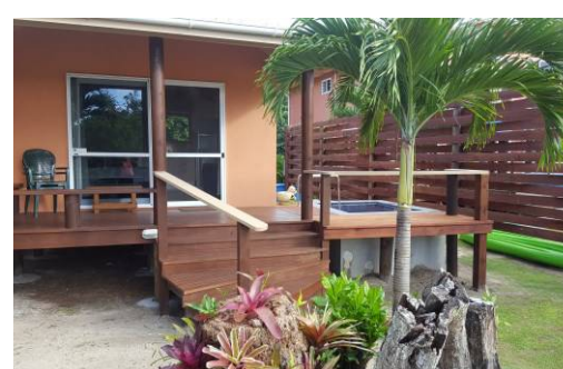
1 Bedroom Studio