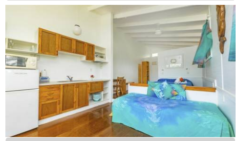
BEACHSIDE DELUXE UNIT