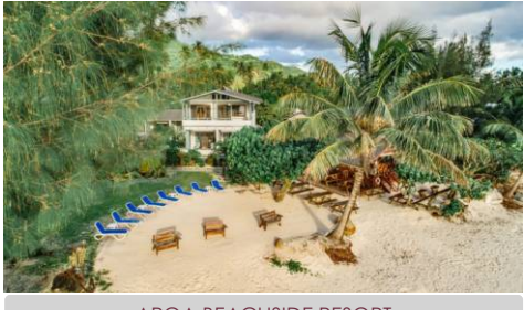
AROA BEACHSIDE RESORT