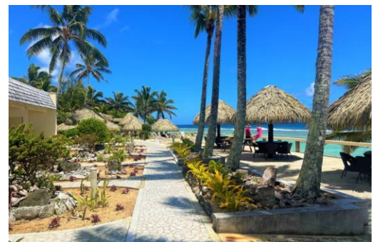
Ocean view terrace