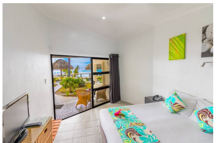
OCEAN VIEW ROOM