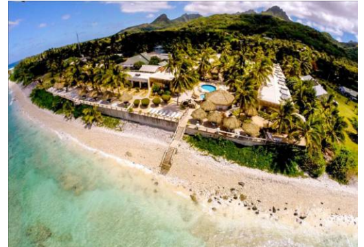
Club Raro Resort

Daily continental breakfast, complimentary unlimited Wi-Fi, shuttle service to The Edge-water Resort & Spa with access to the resort's tennis court and equipment, snorkelling gear and on-site parking.