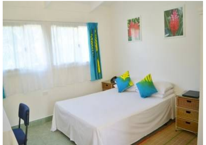
STANDARD SELF-CONTAINED ROOM