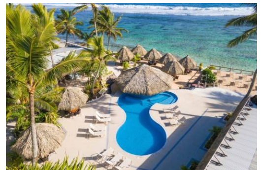
Pool area and swim up pool bar