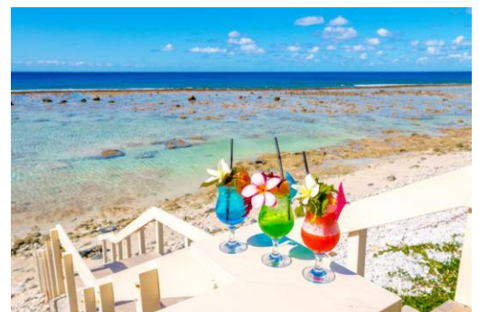
Cocktails on the waterfront