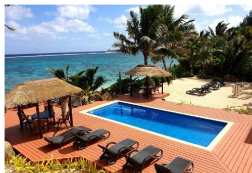
SWIMMING POOL & PICNIC AREA