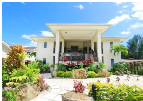
MOANA SANDS VILLAS