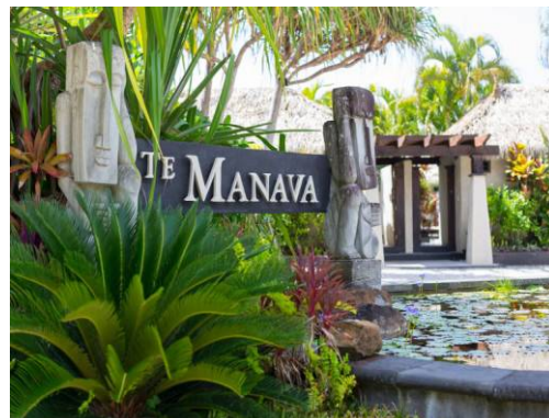
Te Manava Luxury Villas

Te Manava Luxury Villas is crafted for travellers seeking the best of both worlds: the freedom of self-contained living paired with the refinement of luxury accommodation, all set within one of the South Pacific's most naturally beautiful destinations.