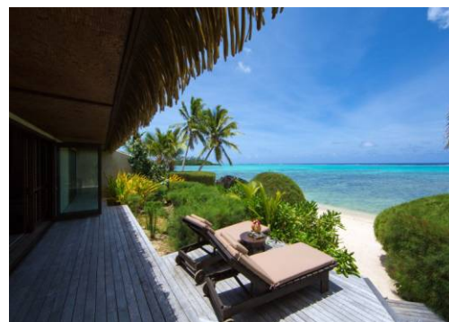
Ultimate Beachfront Villa