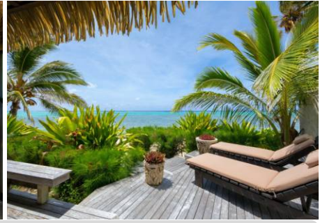
ULTIMATE BEACHFRONT VILLA (1 BEDROOM)