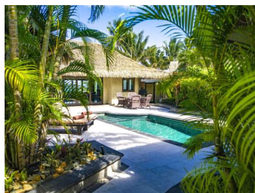
Private plunge pool