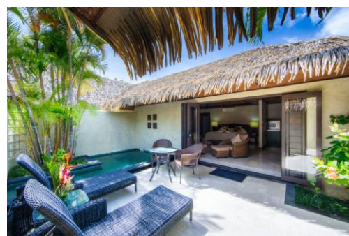
Pool Villa Suite