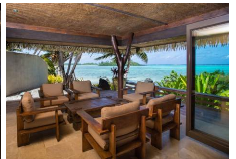
PRESIDENTIAL BEACHFRONT VILLA (3 BEDROOM)