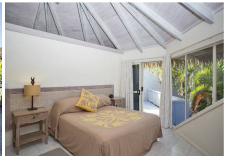
STANDARD POOL VILLA (3 BEDROOM)