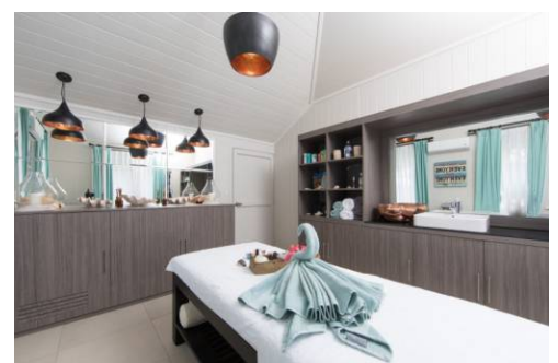
Private spa treatment room