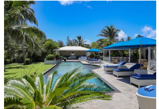
Covered deck and private swimming pool

A truly unique retreat, Waterfoot House offers a private resort experience, perfect for families, friends, or small executive escapes seeking space, comfort, and understated luxury.