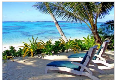
Sit back, relax and enjoy the view