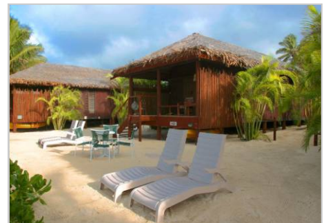
Look out to the lagoon from your bungalow