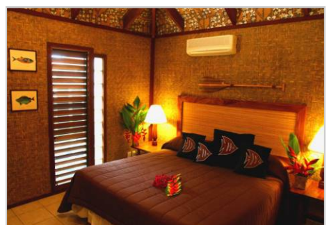
Your bedroom interior