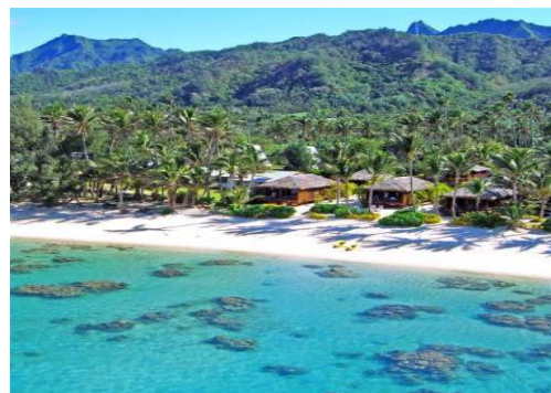
Aerial view of the property

Whether you're sunbathing in stillness, exploring the lagoon, or relaxing on your private deck, Rarotonga Beach Bungalows offers a truly memorable escape in a serene tropical setting.