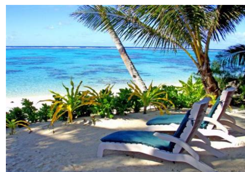
Sit back, relax and enjoy the stunning view