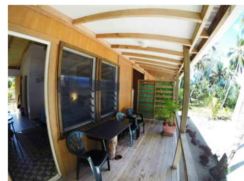
Relax on your own private deck and enjoy the beach view