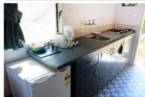
Kitchen Interior, yours to cook up delicious meals