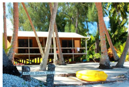
Exterior View of Amuri Sands Units

Return airport transfers and snorkelling equipment are available complimentary to guests.