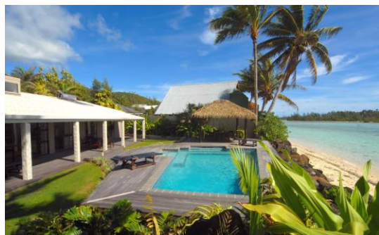
Muri Beach Villa Awaits..

A fully equipped laundry opens to an outdoor covered carport at the rear of the Villa. The Villa is serviced 3 times weekly or if you desire daily service is available.