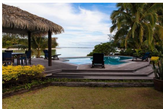
Your own private swimming pool