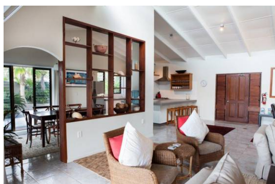
Lounge & dining room interior