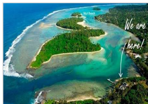
Absolute Waterfront Location

A well appointed property in secluded location with stunning views.