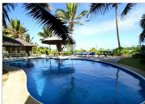
Swimming Pool and BBQ Huts