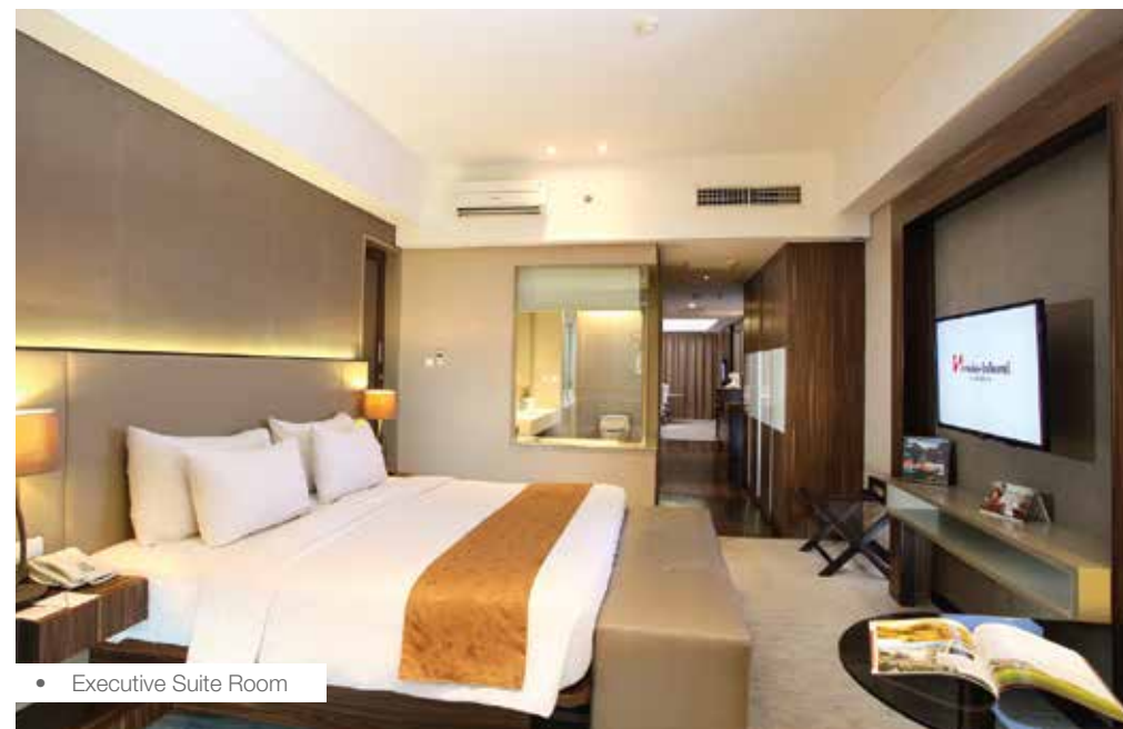
• Executive Suite Room