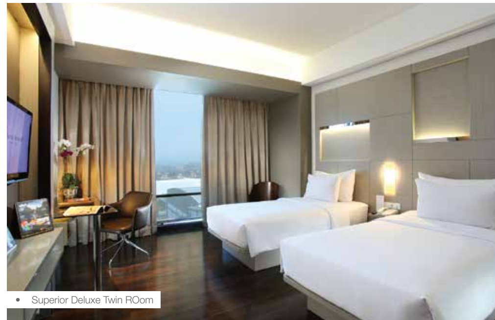
• Superior Deluxe Twin Room